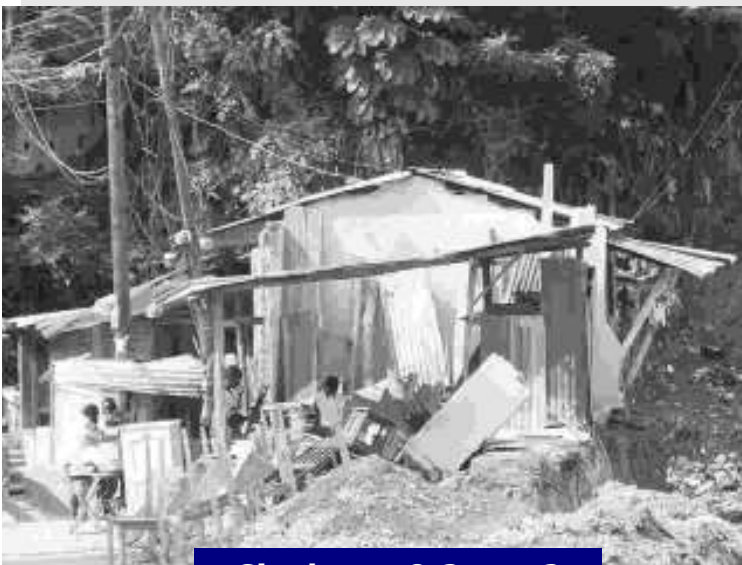
City home & ?store?

We traveled from Port-au-Prince to Milot to Henche and back. And in every city, plus the countryside and many tiny communities in between—every place we visited—we saw people fighting for survival in the midst of overwhelming poverty, virtually no jobs, an eroding economy and ecological system, with very little help to be found.